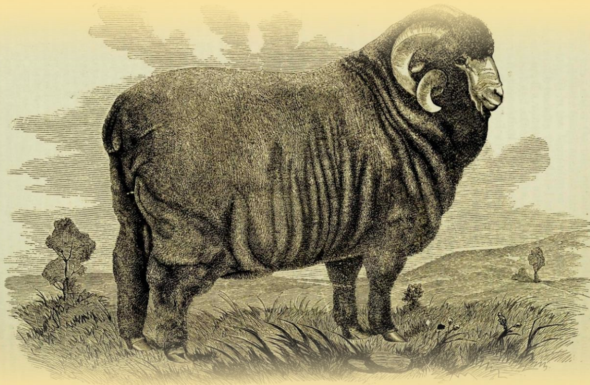
MERINO RAM "SEVILLE" (INFANTADO)