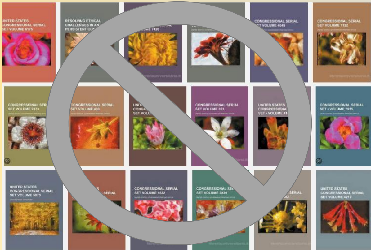
Image results for “congressional serial set volumes” search in duckduckgo.com. – Jan 2016